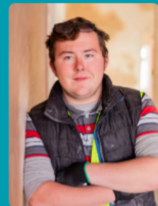
Scott, Future Builder:

We support over 250 young people in accommodation across South Yorkshire every day. If you are able to donate any household goods, starter home packs or any decorating or gardening equipment, this would make a huge difference to our young people.